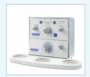
Akuport MR2 + Akuport D-tec

Dimensions (WxHxD): 16x11x15cm, Weight ca. 400g Ground plate: 26x23cm