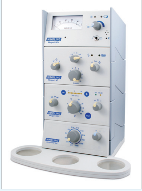
Akuport-Tower complemented with Akuport D-tec